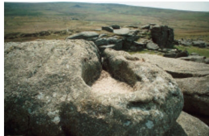
Rock Basin on Gutter Tor.