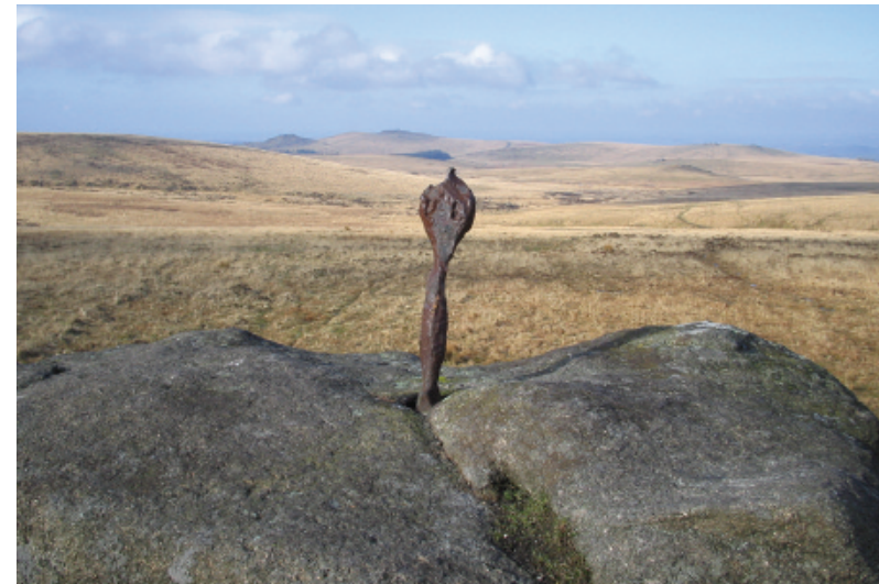
The forest boundary marker on South Hessary Tor.