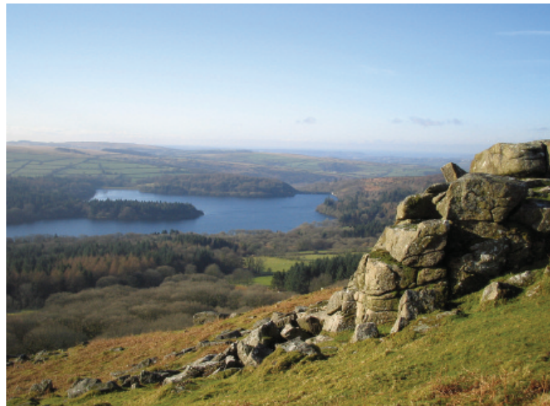
Looking over the reservoir from Peak Hill.